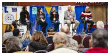
PUBLIC LANDS PAVILION