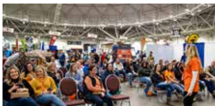
PATH TO THE UPLANDS