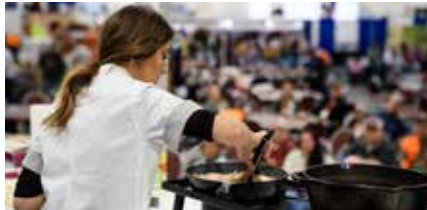
WILD GAME COOKING