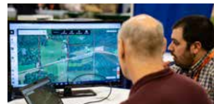
HABITAT HELP ROOM