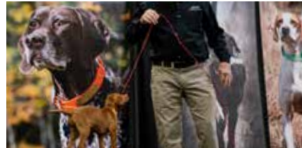
BIRD DOG STAGE