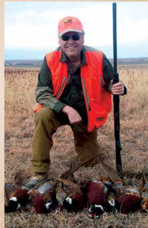
Krull Lodge - Harrold, SD